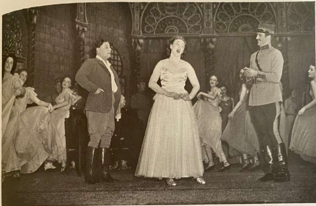
Pierre—alias the Red Shadow—and his rival, Captain Fontaine, listen to the song of Margot